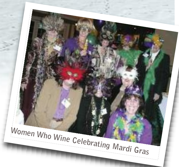
Women Who Wine Celebrating Mardi Gras

We have sent out 2010 dry storage invoices. If you are currently storing your vessel, RV or trailer and did not receive an invoice, please call Candace at 881-8735. Invoices are due by March 19!