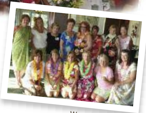
Women Who Wine

How can just one person save the planet? How about planting a tree? Or turning trash into treasure with sculpting? Campers will enjoy an eco-friendly adventure by embarking on a Save the Planet scavenger hunt and making a Save the Planet t-shirt with dyes and waxes. Did you know you can make a terrarium out of a soda bottle and then plant it at home? Campers will also learn to make snacks such as "global rounds" rice crispy earths, and trail mix that is perfect for nature walks. It starts with only one... come to camp this week to learn how you can be the one who starts it all.