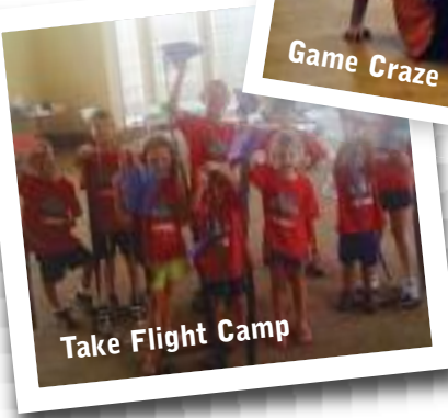
Take Flight Camp